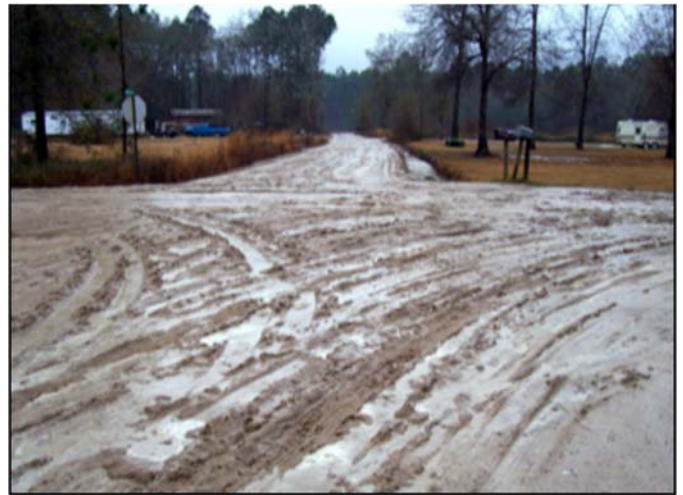
King Road - Before