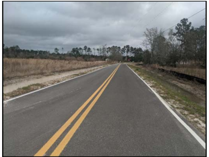
Benefield Lane- After