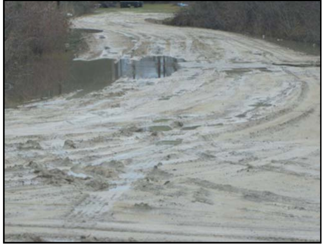
Benefield Lane - Before