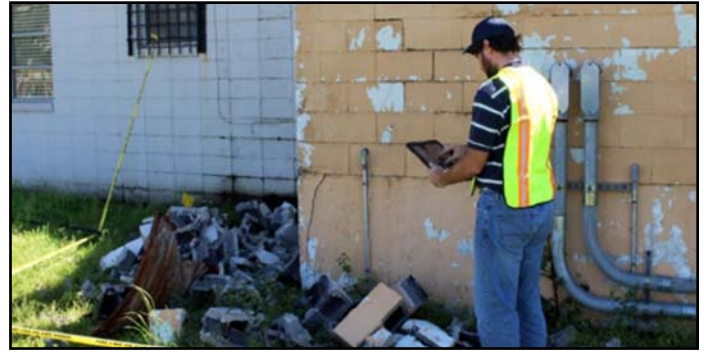
The picture above is an example of how damaged buildings can be mapped after a disaster using RECOP.

The SGRC-GIS Department has a free online mapping application called Regional Emergency Center of Operation (RECOP) that is available to all SGRC communities for use during and after disasters. Officials can input data from a command center during an event or while conducting damage assessments in the field after the event has passed. The map can help with planning coordinated responses