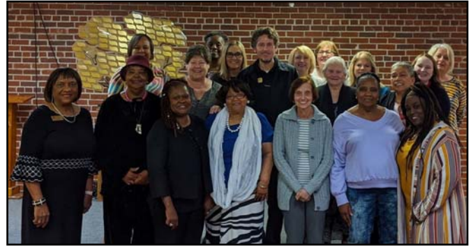
SGRC-AAA Regional Senior Hunger Coalition Meeting participants on February 26, 2020.

The SGRC-AAA Regional Senior Hunger Coalition plans to send representatives to the 2020 Georgia Senior Hunger Summit in Augusta,