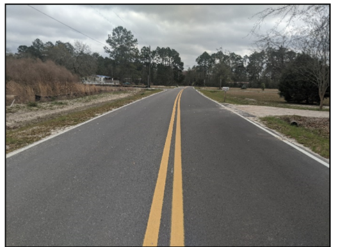
King Road - After