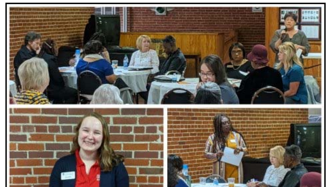
SGRC-AAA Regional Senior Hunger Coalition Meeting February 26, 2020.

Georgia, on June 9, 2020. Sponsored by the Georgia Department of Human Services Division of Aging Services, the 2020 Summit will feature opportunities to learn about and share strategies to address senior hunger in Georgia. The Senior Hunger Summit brings together a diverse group of experts, policymakers, and community stakeholders to heighten awareness of senior hunger in Georgia, unearth issues accompanying the problem, highlight best practices, and share opportunities to combat senior hunger. For more information, call the SGRC-AAA at: 1-888-732-4464; see the webpage : www.sgrc.us/aaa.html ; and like the SGRC-AAA on Facebook: www.facebook.com/SouthernGeorgiaAreaAgencyonAging/ .